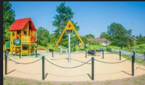
Knutby lekplats - Uppsala kommun uppsala.se