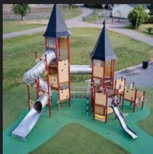
Lekplatsens utformning - HA... hags.se