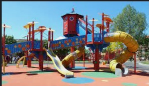
Lekplatsen För alla | helsingborg.se