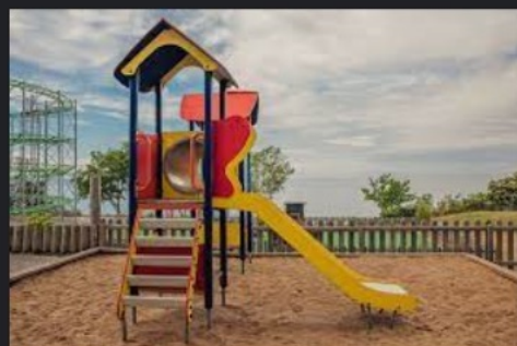
Lekplats - Kneippbyn kneippbyn.se