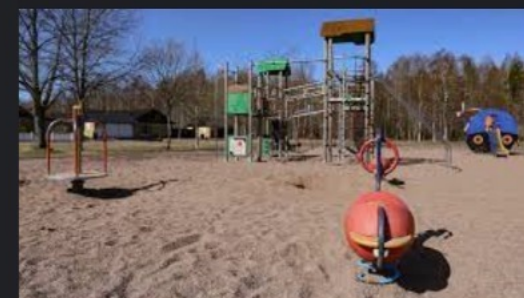
Söderängsparkens lekplats karlstad.se