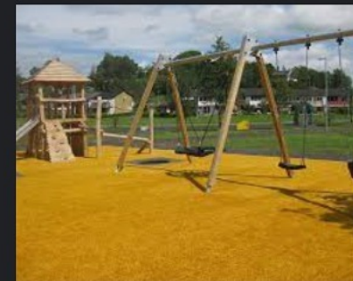
Lekplatser - Mölndal molndal.se