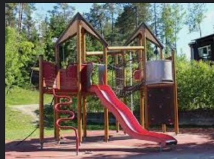
Vistabergs lekplats huddinge.se