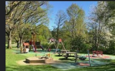
Lekplatser - Höörs kommun hoor.se