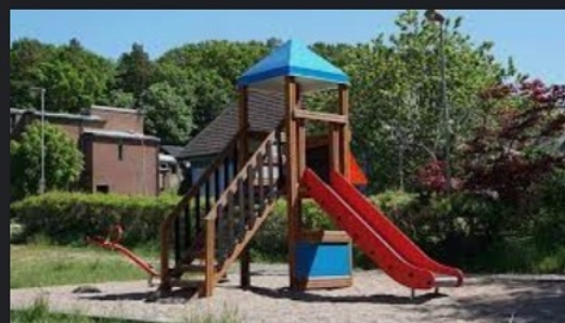
Lekplatser | ale.se ale.se