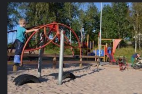
Lekplatser - Gislaved.se gislaved.se