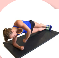
TABLE TOP HEEL TO SKY

Movement: Roll on to left side by placing left elbow to where right elbow is on ground achieving a plank left position. Hold momentarily. Repeat in opposite direction.