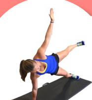
TABLE TOP RUSSIAN KICKS DYNO

Movement: Hold for 1-2 sec, then roll on to left side and assume Star Plank Left position. Hold for 1-2 seconds. Repeat in a steady, controlled pattern. You will go through a 4 point position during the roll (both hands & feet on ground).